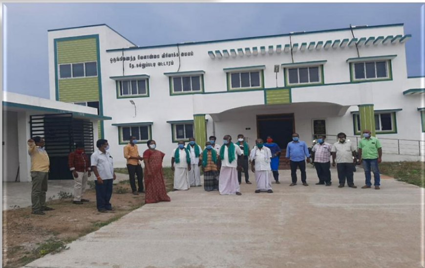
Farmers in front of IAEC