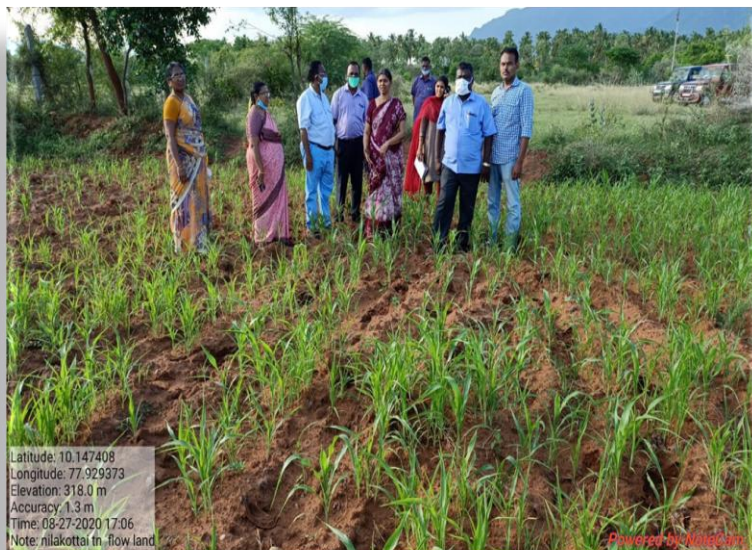
Millet cultivation in Fallow land

❖ An additional production of 1,789 MT of Millets, 1,982 MT of Oilseeds and 3,422 MT in pulses has been achieved.