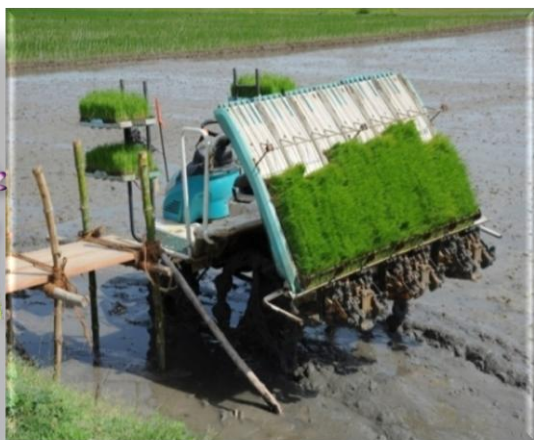
Assistance for SRI/Paddy Transplanting