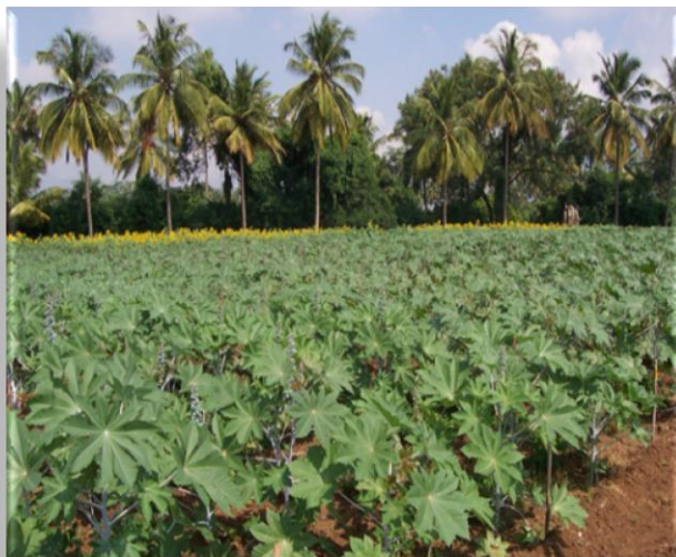
Assistance for Castor Production