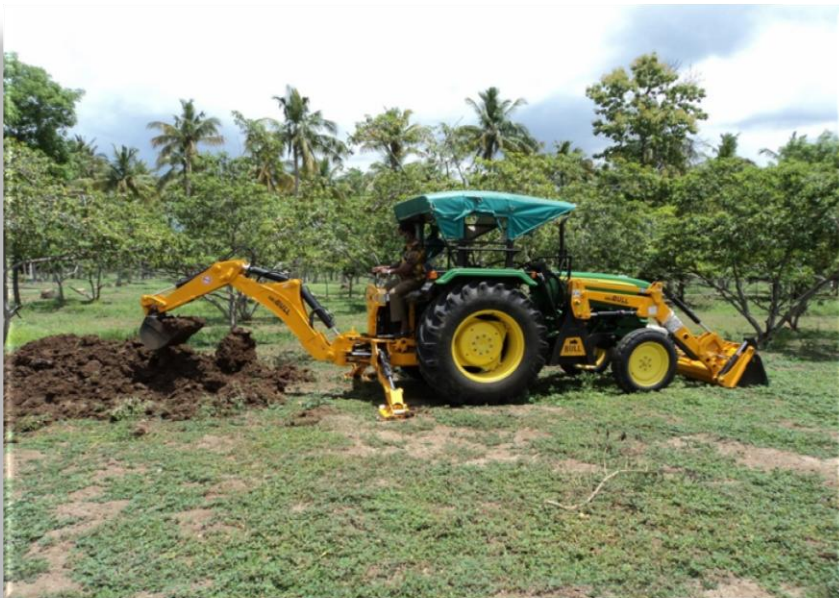
Tractor operated Trench Cutting Machine at Work in field

Apart from the above specific projects under RKVY which made a difference, the following activities of the Department of Agriculture were supportive of the implementation of RKVY projects and instrumental in making Agriculture sector and farmers thrive during the difficult period.