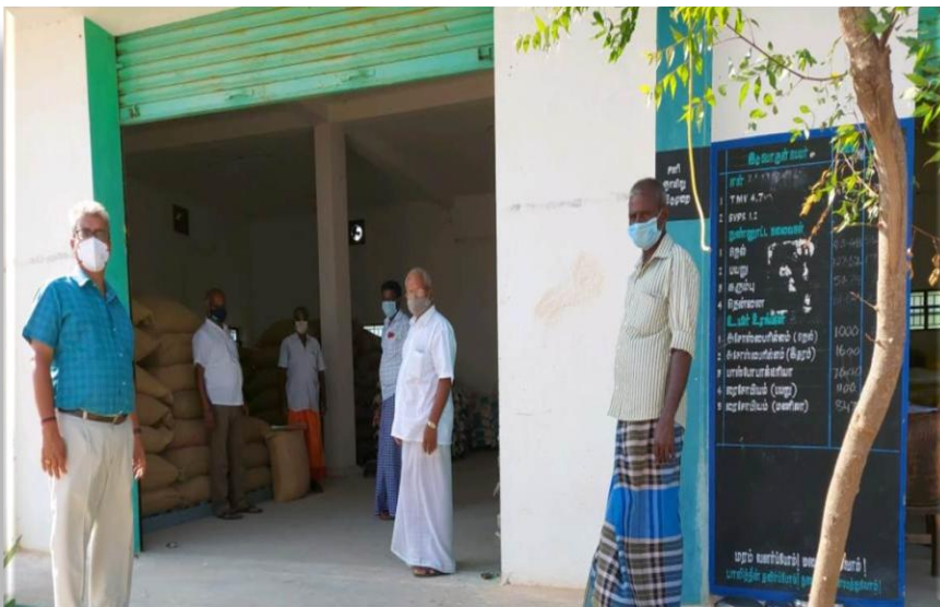
Input Distribution to Farmers from IAEC Godown

The IAECs are very well qualified to be called as "One Stop Shops" for most of the farmers' requirements. Provision of decent floor space for officers, staff and visitors has been helpful in maintaining the social distancing norms and adhering to Covid-19 protocols. Since the year 2015-16, 156 IAECs have so far been created in the State under RKVY and 9 are under construction out of 383 existing block level set up. The importance of these IAECs has been starkly felt when compared to the blocks devoid of IAECs.