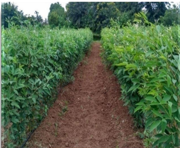
Assistance for Redgram Production

Rs.2 crore was extended as assistance to 4,500 farmers growing Redgram, Castor and sunflower with vital inputs at subsidized rate.