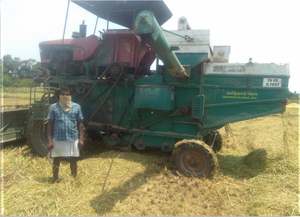
Paddy Combine Harvester at Work in field